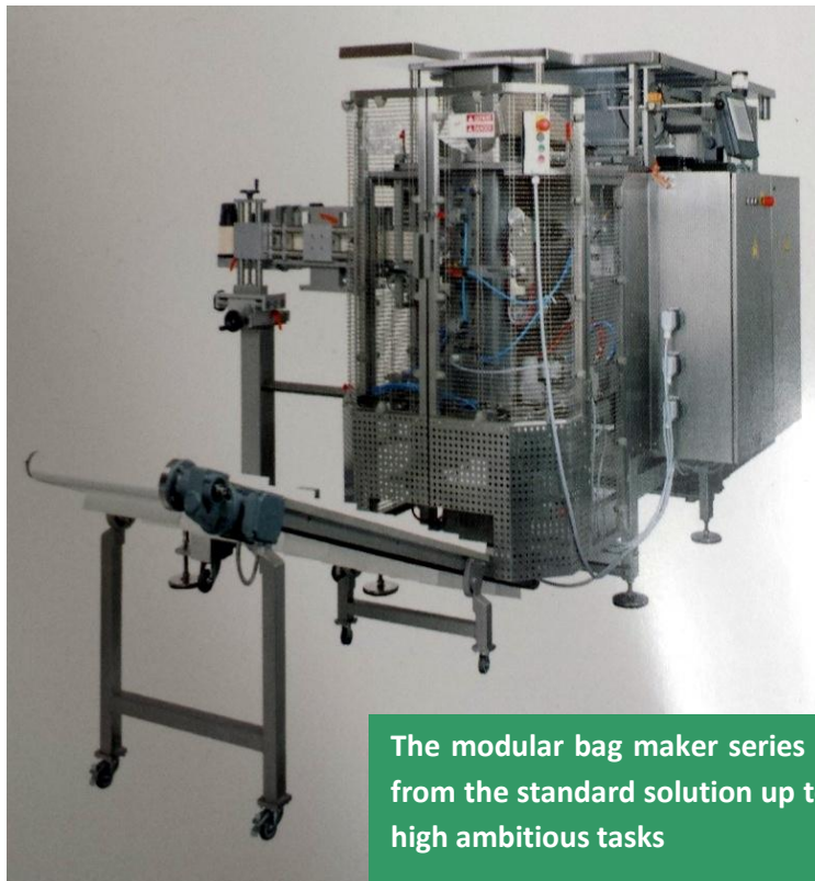
The modular bag maker series – from the standard solution up to high ambitious tasks